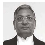
Justice S N Aggarwal (Retd.) High Court of Uttarakhand.