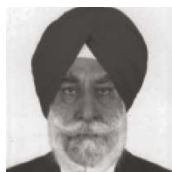
Justice Kamaljit Garewal (Retd.) He was a sitting United Nations Appeals Tribunal and Punjab and Haryana High Court judge.