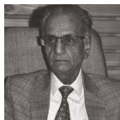
Justice S.M. Soni (Retd.), Gujarat High Court and former Lokayukta of Gujarat