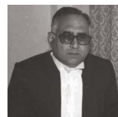
Justice Rajesh Tandon(Retd.) High Court of Uttarakhand Former Chairperson, Cyber Appellate Tribunal