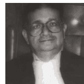
Chief Justice Chittatosh Mookerjee(Retd.) Bombay High Court. Residing in Calcutta.