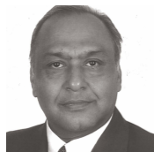
Justice Viney Mittal Former Judge Punjab & Haryana High Court