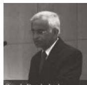
Justice K C Sood (Retd.) Himachal Pradesh