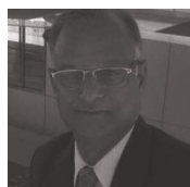
Justice Vinod Jain(Retd.) Allahabad High Court.