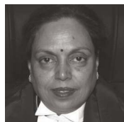
Justice Aruna Suresh (Retd.) High Court of Orissa & Delhi